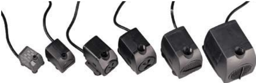
PS4 PS1 PS1.5 PS3 PS450 PS850