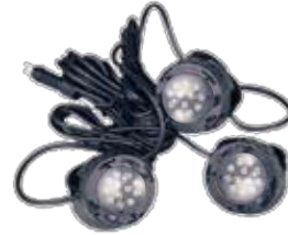
AB873L 3 PC. LED LIGHT SUBMERSIBLE KIT