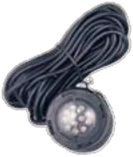
AB871L 1 PC. LED LIGHT SUBMERSIBLE KIT