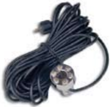
AB870 1 PC. SUBMERSIBLE PLUME LED KIT