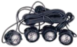
AB874L 4 PC. LED LIGHT SUBMERSIBLE KIT